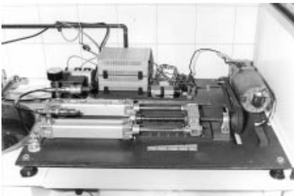
Figure 3 View of the entire simulator system. The piston pumps can be seen at the left.

The following selection criteria were established to ensure greater homogeneity of the samples. The purpose of these statistical criteria was to determine the probability that each membrane tested actually belonged